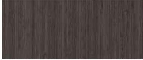
Asian Night – 7949-18