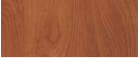
Wild Cherry – 7054-60