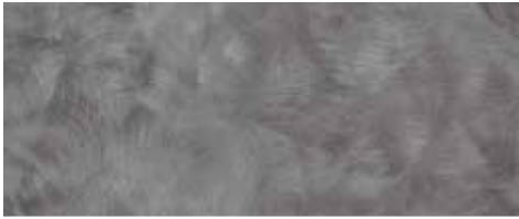
Pewter Brush – 4779-60