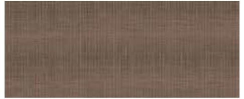
Rugged Linen – 4989-38