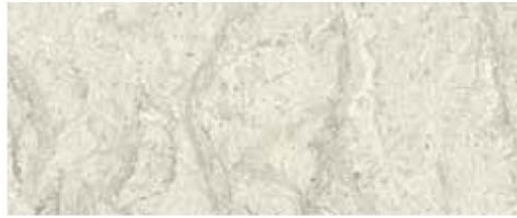
White Cascade – 5003-38