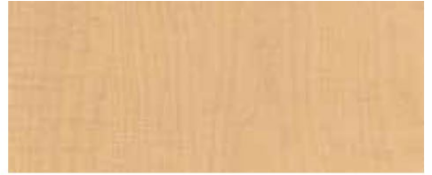
Fusion Maple – 7909-60